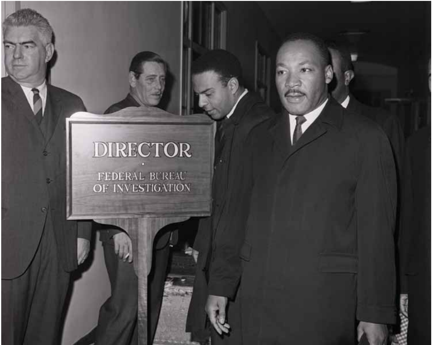
Martin Luther King arrives at the FBI to speak with J. Edgar Hoover on December 1, 1964. Their meeting was highly publicised, but evasive and dishonest on Hoover's part