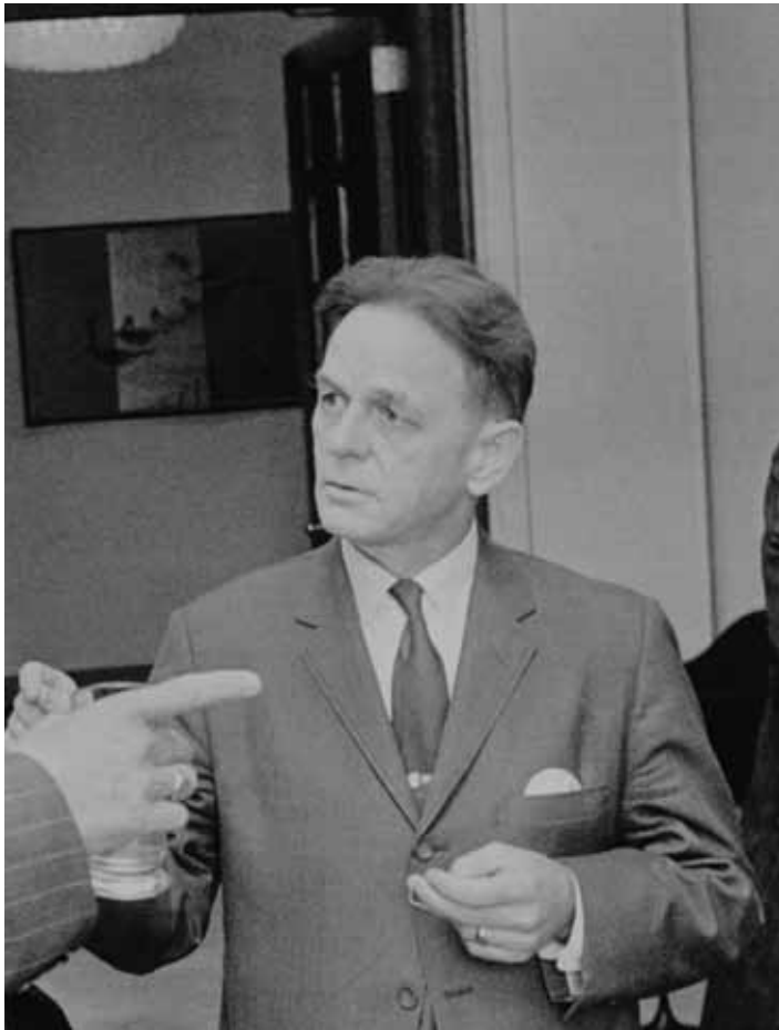
William C. Sullivan: As head of the FBI's Domestic Intelligence Division he had an intense fixation on King's conduct

The FBI's failure ever to cite those figures in its warning memos to Kennedy, coupled in March 1964 with its failure to emphasise Levison's simultaneous large gifts to King, inexplicably rendered its "secret member" allegation against Levison far less powerful than could have been the case. To have a reported "secret member" writing some of King's speeches, as the FBI highlighted to Kennedy, was one thing, but the remarkable dollar amounts Levison was bandying about could have made for a much more striking portrayal than the FBI ever painted.