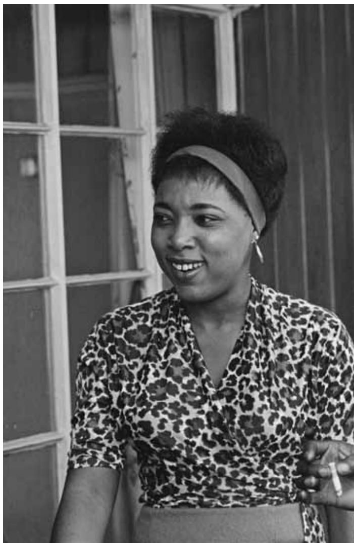
Dorothy Cotton in October 1963: The most important woman in King's life never explicitly discussed her relationship with him

On Wednesday, November 18, J. Edgar Hoover told a group of women reporters that King was "the most notorious liar" in the US, ostensibly because of how King had criticised southern FBI agents two years earlier. Hoover added "off the record" that King "is one of the lowest characters in the country", but the "notorious liar" characterisation generated widespread headlines. King responded with a telegram telling Hoover that he was "appalled and surprised at your reported statement maligning my integrity" and with a public statement asserting that the 69-year-old Hoover "has apparently faltered under the awesome burden, complexities and responsibilities of his office".